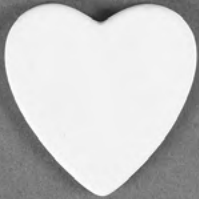
33442 Heart Embellie 1.45" x 1.5" x .15" 12 per case